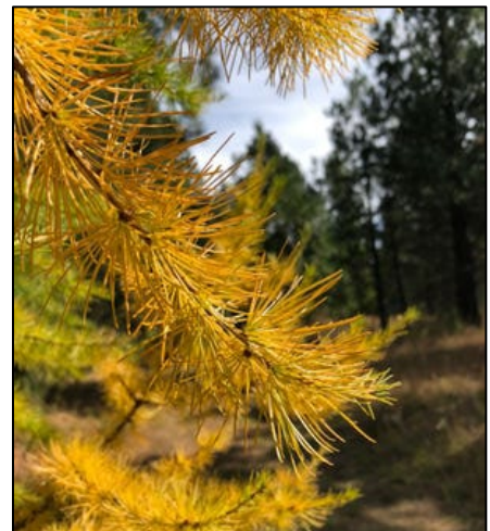
Larch in Fall Color.