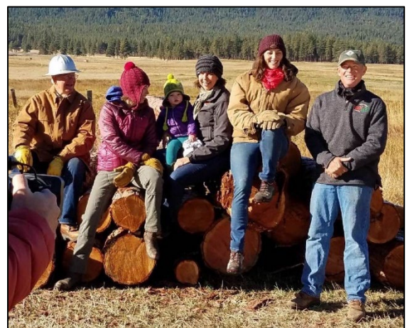
Defrees Family on the Ranch