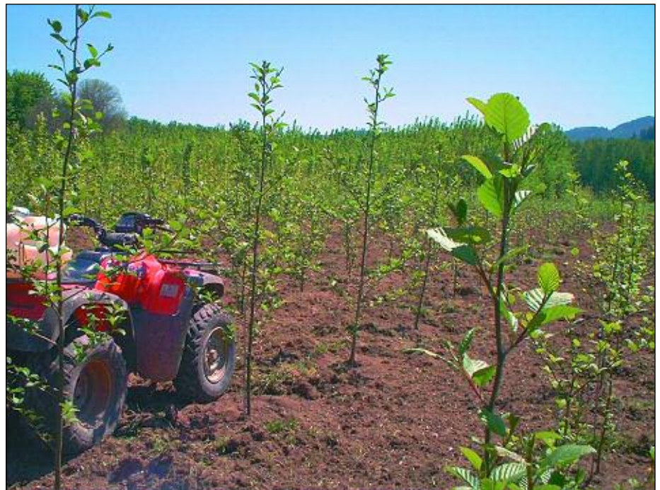
Alder plantation at one year.

This interest in western hardwoods had simple beginnings. The charter members of what is now known as the Western Hardwood Association (WHA) were maligned with eradication of a species (red alder) that provided them a living. Foresters throughout the region were using any means available to eliminate what was known as a "weed"