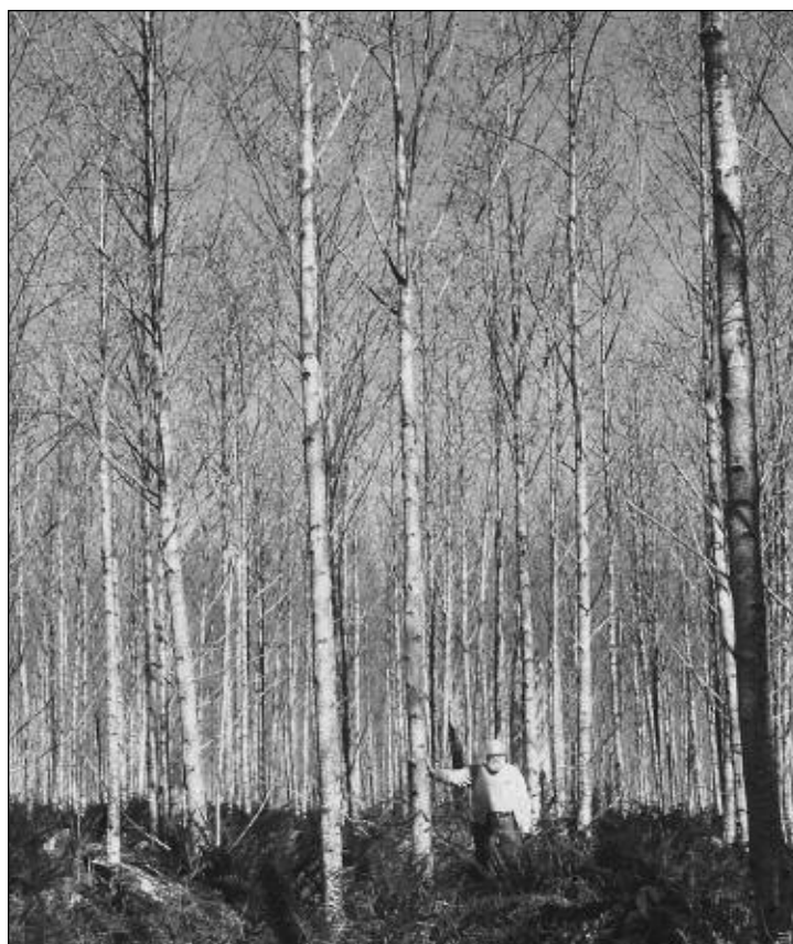
A 12-year-old red alder plantation on red alder site index 100 feet near Silver Lake, Wash.—three years after pre-commercial thinning from 600 to 360 trees per acre.

Thinning. Our understanding of density management and thinning in